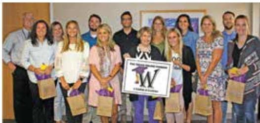
WYLIE JUNIOR HIGH