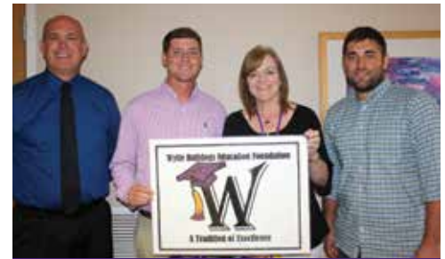
WYLIE MIDDLE SCHOOL