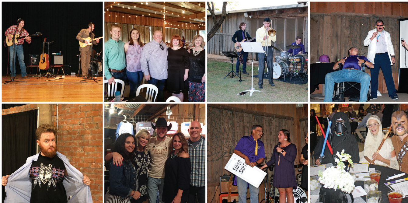
The We are Wylie Dinner has provided lots of music and laughs over the years, but the best part is spending an evening with our amazing friends in the Wylie community.

The Foundation Board of Directors is excited to bring back the in-person dinner in 2022. We are eager to have Wylie supporters together, under one roof, celebrating our achievements and honoring Wylie graduates who have returned to work at Wylie. It is such an honor to work together with the amazing Wylie community and our awesome donors to continue fostering excellence in the Wylie Schools. We all share the pride of helping our students receive a Grade A education. It is great to be a Wylie Bulldog supporter!